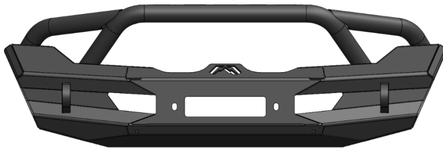
23456 - BUMPER